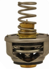
(A) Type Cage Unit

Available to repair over 1,000 different models and makes of thermostatic steam traps. Refer to the Steam Trap Selection Guide to find a Cage Unit specifically designed to repair any make of thermostatic steam trap.