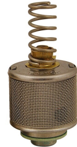
Super Trap Cage Unit